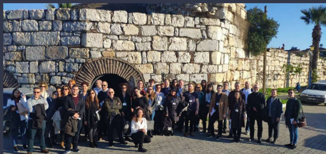
Shelter team in Seferihisar